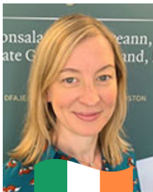
LAOISE MOORE CONSUL GENERAL OF IRELAND