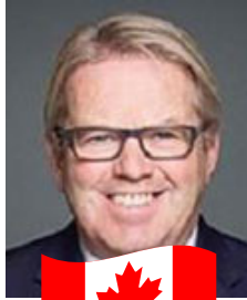
RODGER CUZNER CONSUL GENERAL OF CANADA